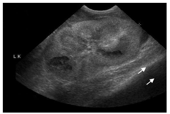
Fig 1 . A sagittal sonogram of the left kidney in a cat with renal lymphosarcoma. Several hypoechoic nodules are observed in renal parenchymal tissue (arrows).

was bilateral in four cases; these were classified as grade I (n = 2), grade II (n = 1), and grade III (n = 2). Loss of corticomedullary distinction was present in 4 cats. In five the abnormality was bilateral and generalized, and in 4 cats it was unilateral (of which it was generalized in 1 cat and focal in 3 cats). Three cats had hypoechoic lesions. These consisted of hypoechoic nodules, hypoechoic masses, and hypoechoic areas (Figure 1).