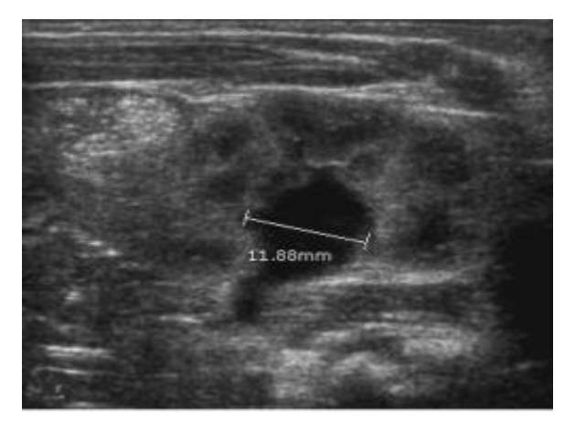
Fig 2. Transverse ultrasound plane of a right kidney in a cat with renal lymphosarcoma. Measured between the crosses illustrating garde II of renal pelvic dilatation (pyelectasis).

small intestinal wall, rectal mass, minimal retroperitoneal fluid, and hyperechoic perirenal fat. In 3 cats, the ultrasound revealed mild pyelectasis, abnormalities: grade mild 1 renomegaly, and focal loss of corticomedullary definition in one cat; grade I and grade II pyelectasis in another (Figure 2), and grade I pyelectasis, focal loss of corticomedullary definition and hyperechoic areas in the medulla in the last. In one cat, the initial ultrasound revealed only mild renal enlargement, focal loss of corticomedullary distinction, and grade I pyelectasis, findings compatible with nonspecific nephropathy.